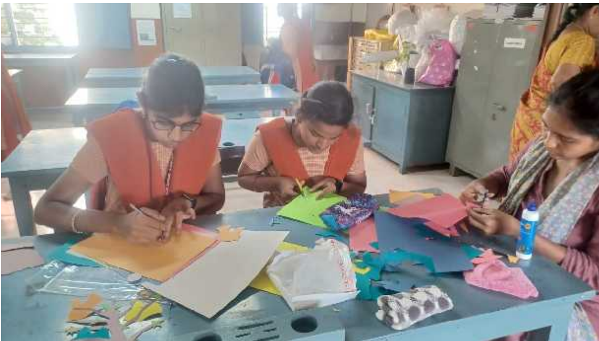
Sparrow models being observed by madams