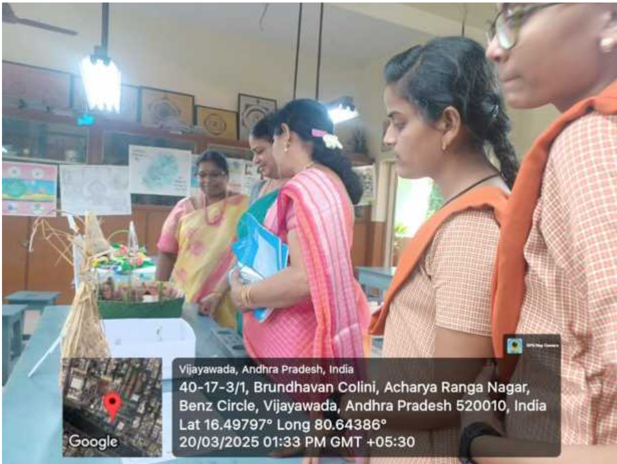
Sparrow models being observed by madams