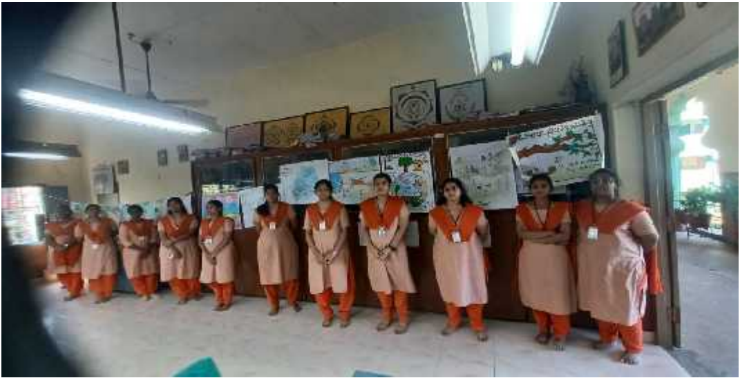
The students poster presentation