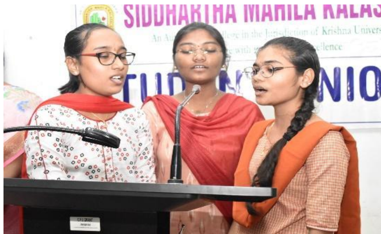
PRAYER SONG BY STUDENTS