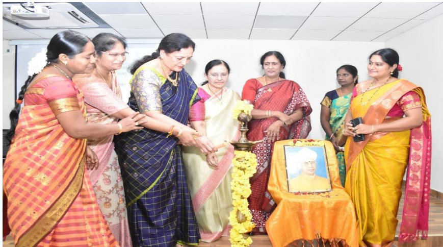
Lighting the Lamp