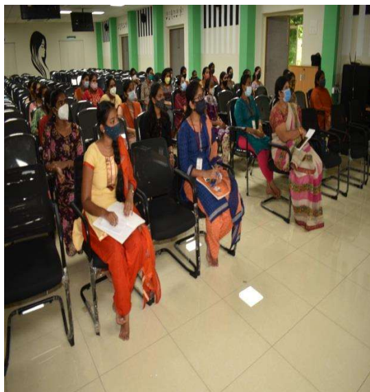
Final Biochemistry Students