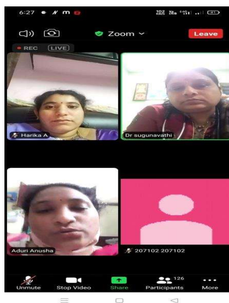
Participants of Online Webinar