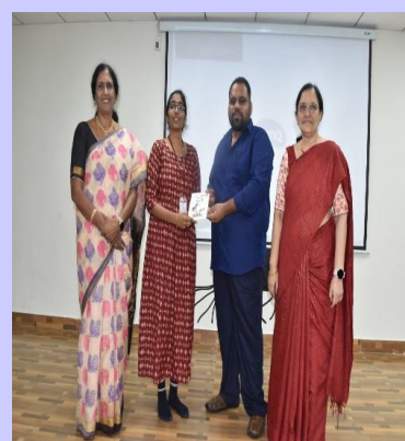
D.Gnanadeepika II B.C. Poster presentation