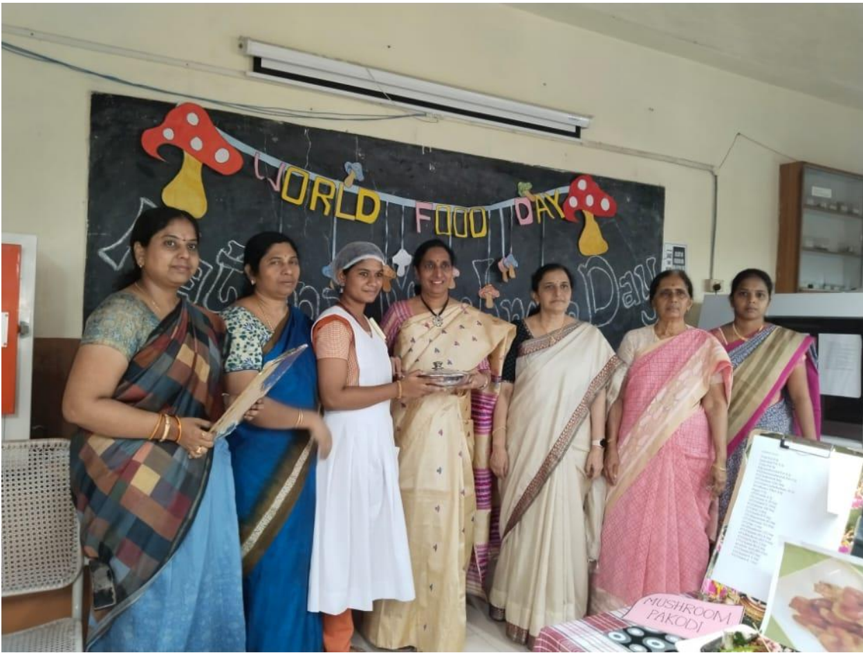
First prize winner