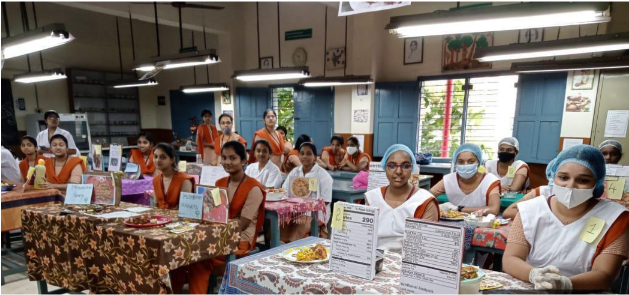
Students displaying their prepared mushrooms recipes

On the occasion of WORLD FOOD DAY 16-10-2022 Department of Botany Organized Mushrooms Culinary challenge on 15-10-2022. Total 20 different Mushroom tasty recipes were prepared by the students and won Prizes students of III BZC AND III FMB participated in this competition..