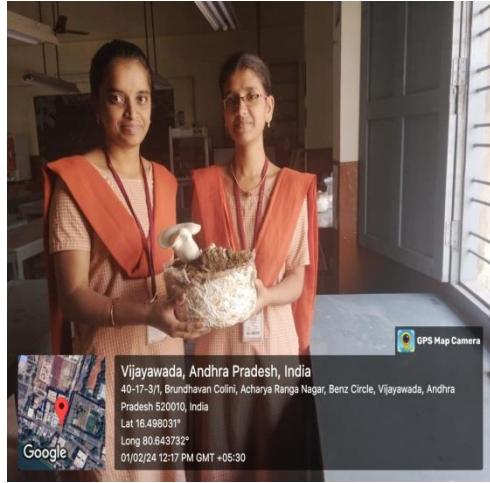
Milky mushroom formation