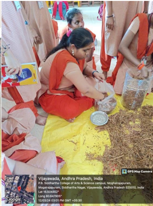
SPAWNING BY SOWMYA II BZC