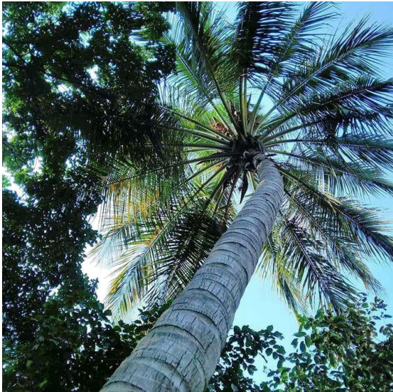
Radial view of a Tree