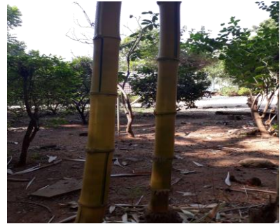
Cylindrical and parallel Trees