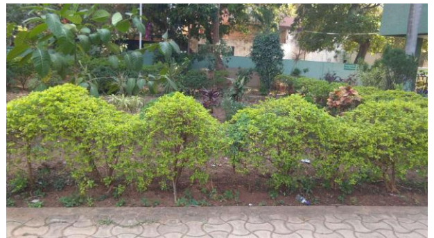
Pattern of Sinx graph