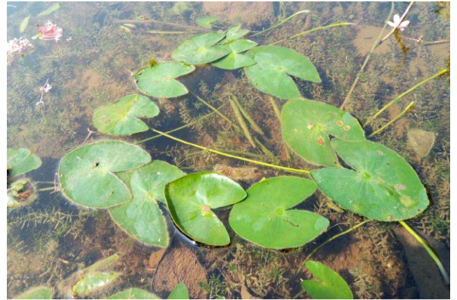
Pattern that of a Triangle