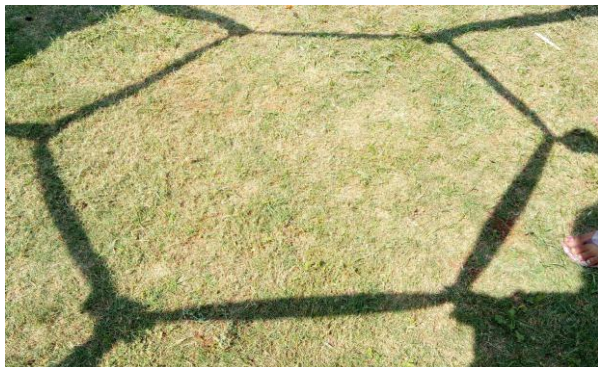
Hexagon in a shadow