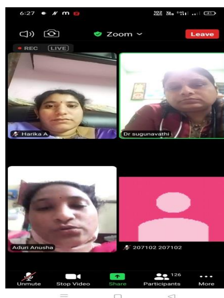
Participants of Online Webinar